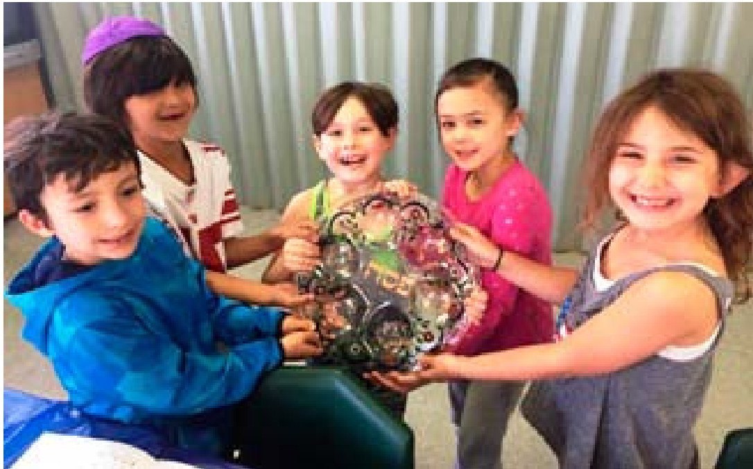
Kitah Aleph/Bet Model Seder