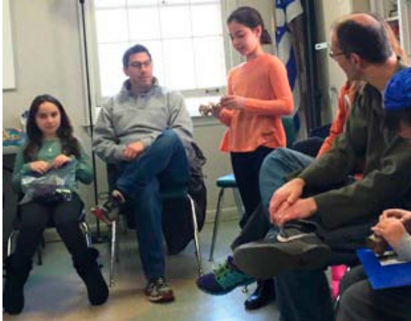
Kitah Daled Heritage Day