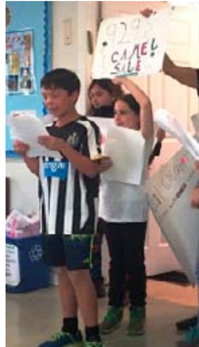
Kitah Daled (fourth grade) performing a Passover play