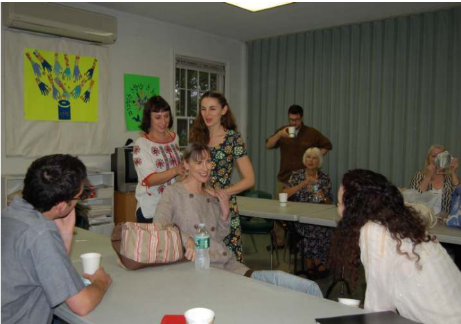
The cast before the performance