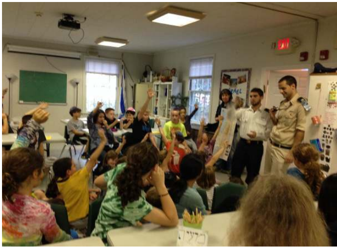
Israeli soldiers take questions from the enthusiastic students