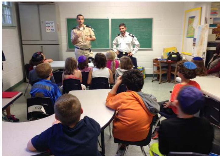
IDF soldiers speak with the 3rd & 4th grades about Israel