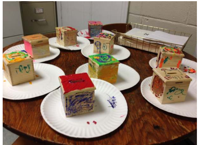
Tzedakah boxes decorated by the Alef/Bet (1st/2nd grade) class